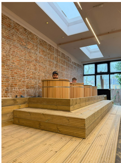
Pulse Club — our new neighbour: ice baths and a 20-person sauna!

The signage for our new neighbour Pulse Club has gone up this week. Our old studio space is now home to ice baths and a 20-person sauna — Pulse are on course for their opening very soon!