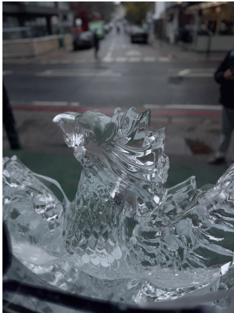
Phoenix stares icily at the rain...

Our GoFundMe campaign continues — every contribution, big or small, is hugely appreciated. Please share our story on your social media wherever possible.