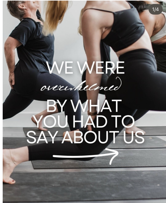
ClassPass Best Studio Award