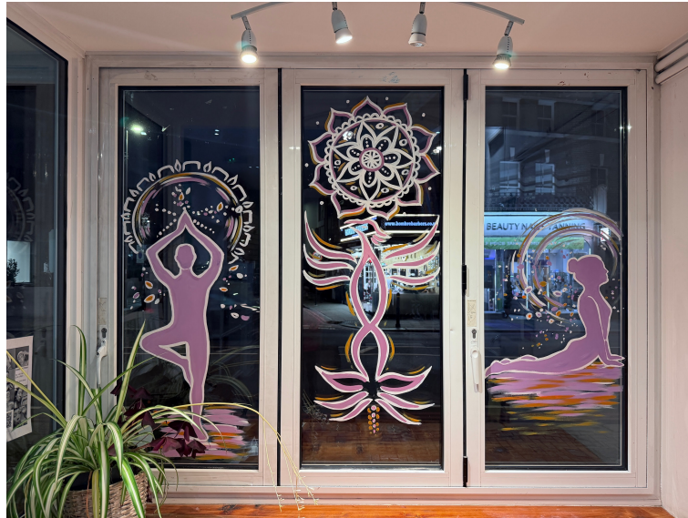
New artwork on the studio windows