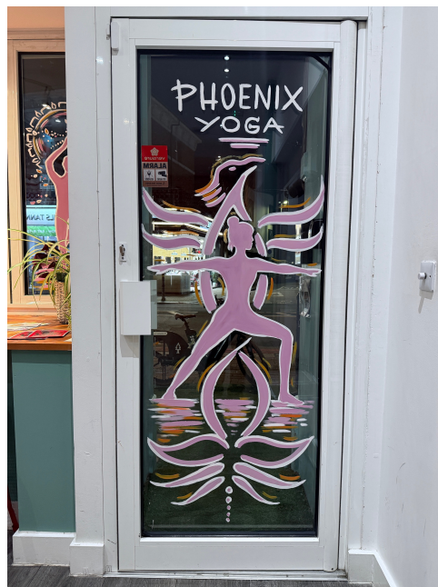
Phoenix Yoga Putney

Our GoFundMe campaign continues — thank you for all your support. Every contribution makes a real difference. Please share with friends and family.